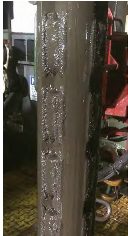
The MAGNOGARD magnet with completely full collection valleys after a drilling run in Texas.

The MAGNOGARD magnet was used while drilling the 8.5-in horizontal section to TD and successfully recovered 33 lbm [15 kg] of ferrous debris to surface. Removing this debris from the system enabled the RSS to perform optimally and eliminated previously experienced steering issues. Removing the ferrous debris from the system extended the downhole tool life and improved tool performance.