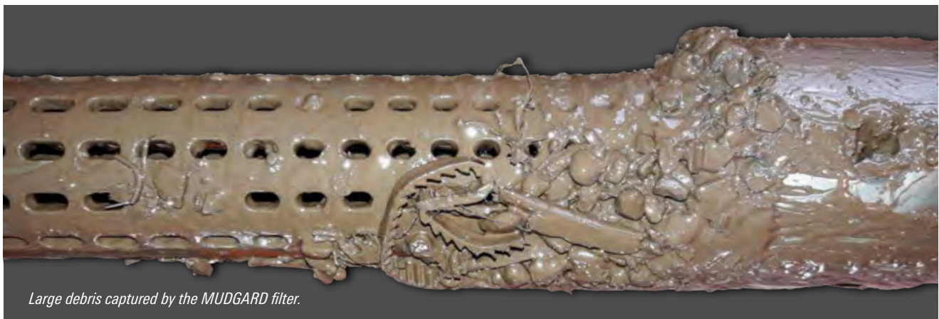
Large debris captured by the MUDGARD filter.