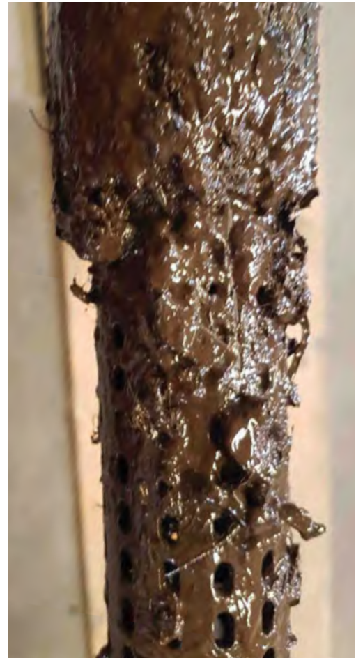
The MUDGARD filter after recovering a variety of potentially damaging debris.

Because of the field trial's success, incorporating the MUDGARD workstring filter into the BHA has become a standard practice for the operator in extended-reach wells. The operator now plans to use the innovative filter in the next sections of its upcoming horizontal wells.