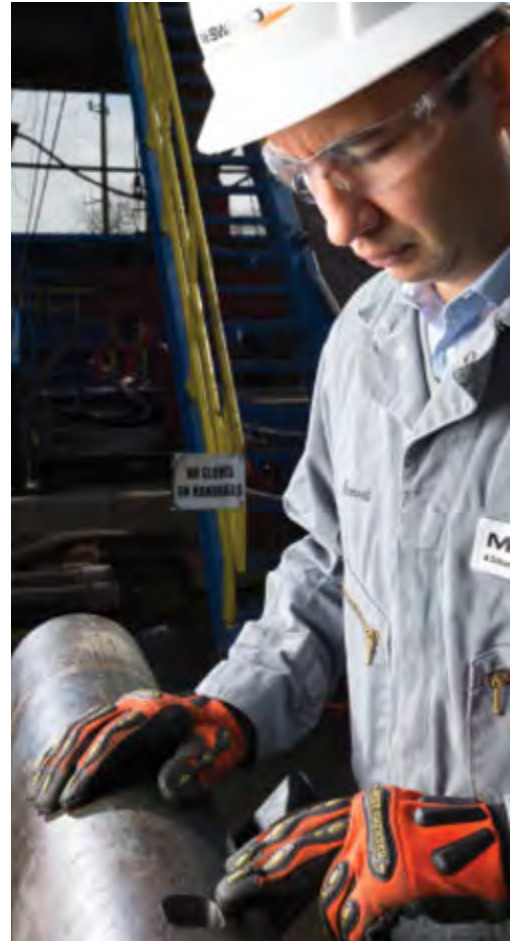
M-I SWACO field technicians inspect the WELL COMMANDER valve to insure proper preparation for a run.

The WELL COMMANDER valve was positioned at 80° inclination above the drilling BHA to mitigate drilling hazards and to boost annular velocities as required. Several high-viscosity, weighted sweep pills were pumped through the ports of the WELL COMMANDER valve at high rates to facilitate hole cleaning and cuttings removal. Once the operator began to use the valve, it found that the cuttings volume at surface increased by more than 150%. When the well reached TD, the operator swept the hole one more time but found that it was clean. As a result, the operator was comfortable casing the well. The annular velocities achieved while using these pills would not have been possible without the improved hydraulics provided by the WELL COMMANDER valve.