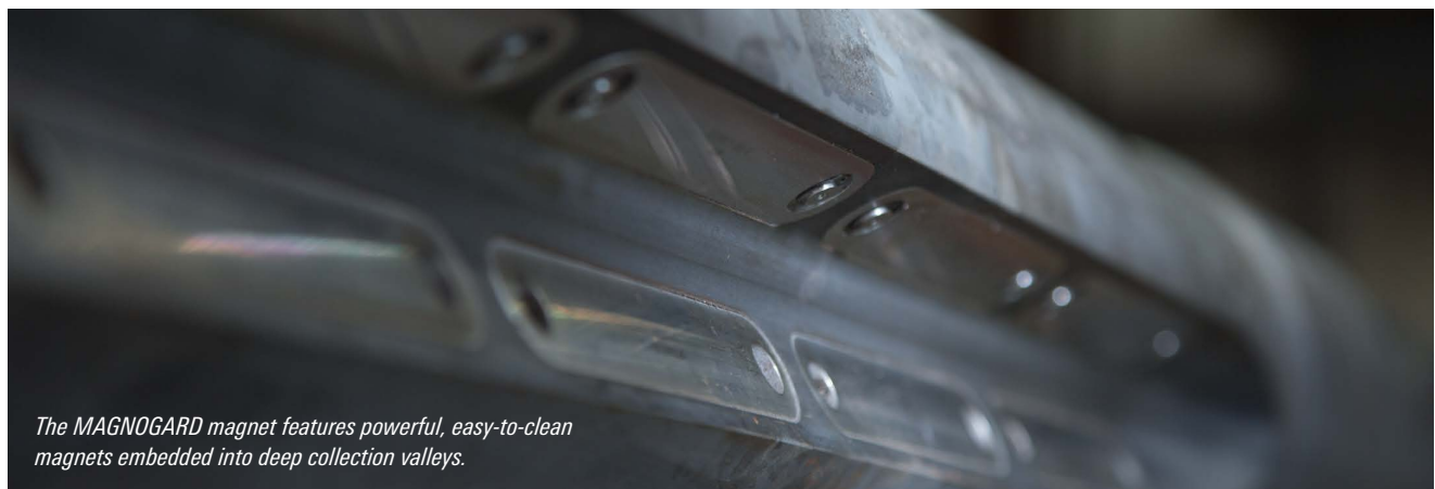
The MAGNOGARD magnet features powerful, easy-to-clean magnets embedded into deep collection valleys.