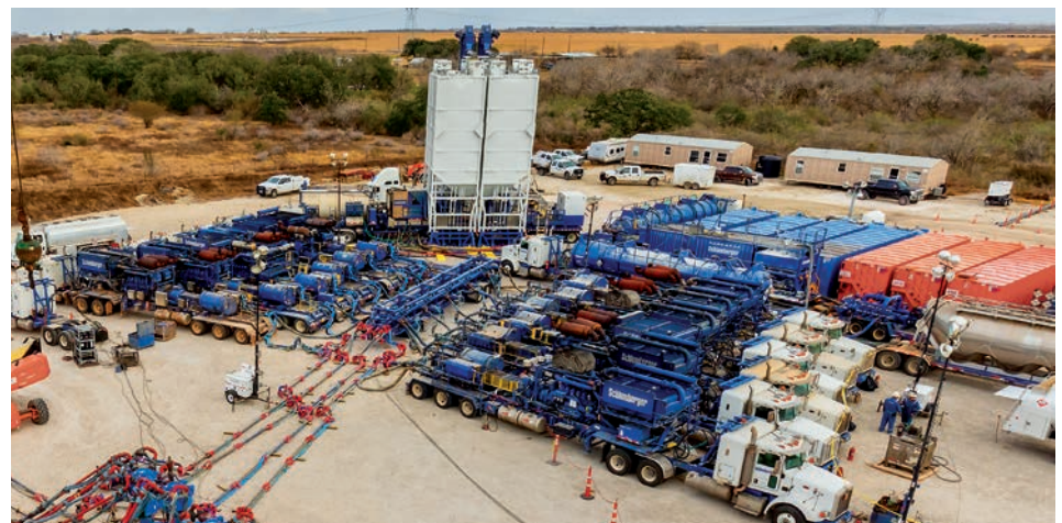
Integrated split stream operations are used to pump water and slurry simultaneously for increased operational efficiency and reliability.