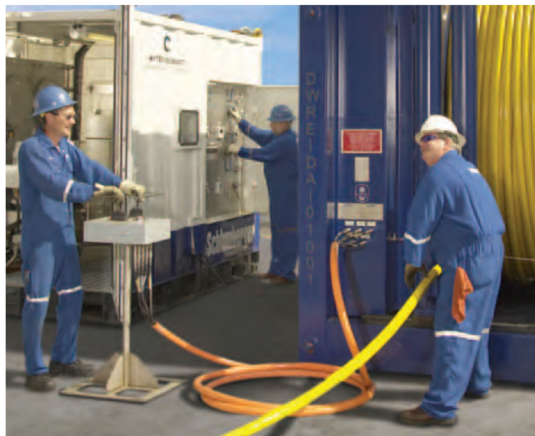
Fast-acting control systems are ideal for completion installations and well test applications performed from a dynamically positioned vessel and can provide function-status monitoring to assist with management of completion operations.

To date, Schlumberger has completed hundreds of subsea well control jobs using SenTREE SCTT systems with direct-hydraulic or fast-acting control systems.