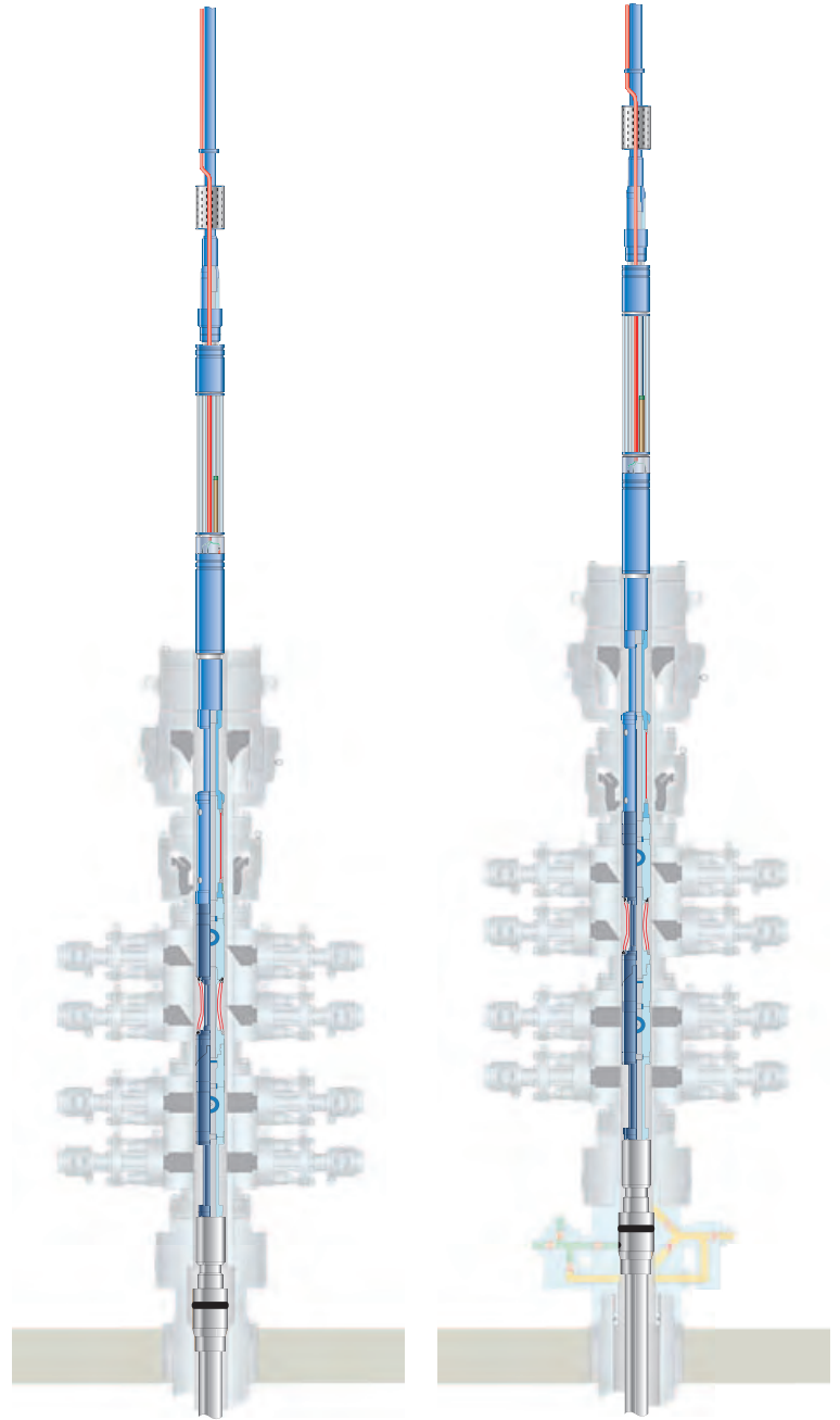
The flexibility of SenTREE systems suits them ideally for integration with any subsea BOP stack and completion, well-test, or Christmas tree system. Completion operations before installation of conventional Christmas tree or DST operations (left) and completion operations with a horizontal Christmas tree (right) are shown above.