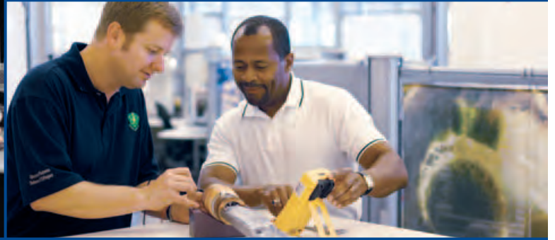
Each local operation is fully supported by a centrally managed global network.

■ Europe Learning Center, Paris, who provide all levels of project management and subsea well control training for engineers, specialists, and operations personnel. The structured courses conducted here ensure a consistently high standard of operations throughout the world.